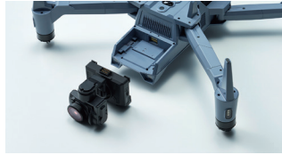
Wide expandability, including one-touch switchable cameras, top mounting, and MAVLink