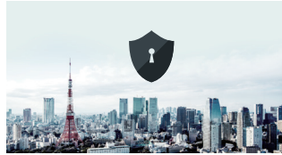
Security measures for flight data, communications, and photo/video data