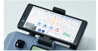
Easy-to-operate user interface