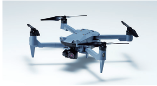
Small Aerial Photography Drone 1.7kg/65cm wide/IP43